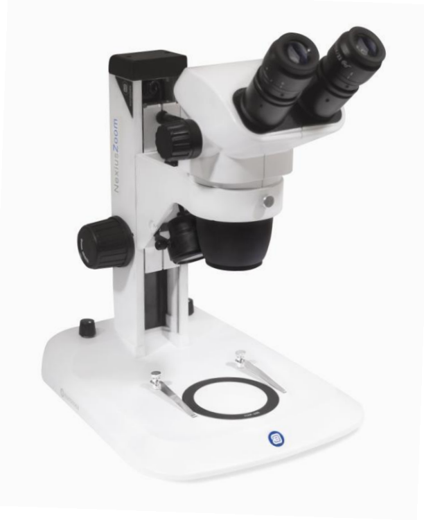
NexiusZoom with rack and pinion stand NZ.1902-S

Bino- or trinocular heads with 45° inclined tubes Both eyepieces with \pm\,5 diopter adjustments Interpupillary distance adjustable between 54 mm and 75 mm