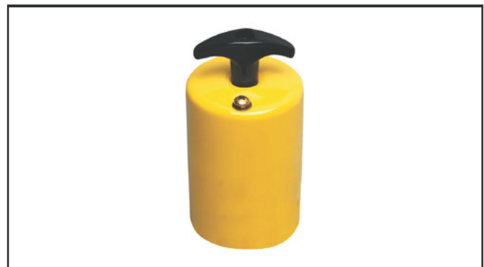
Figure 8. EMIT 50784 5-Pound Electrode for Limit Comparator