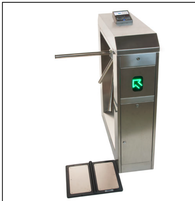
Figure 1. EMIT 50782 SmartLog Pro™ with Turnstile

Made in the United States of America and Britain