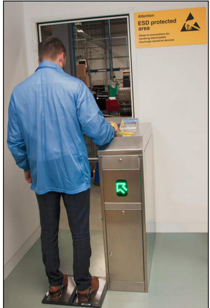
Figure 5. Performing a footwear and wrist strap test

When performing a wrist strap* test, be sure to completely plug in the wrist cord into the tester's jack.