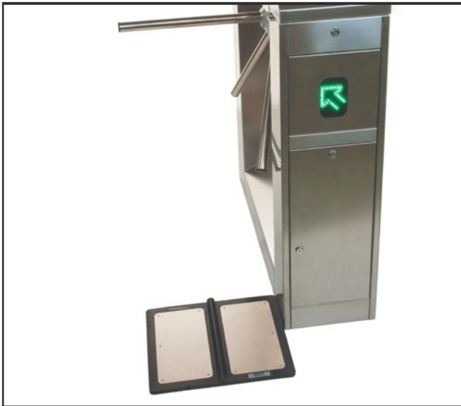
Figure 2. Installing the Dual Independent Foot Plate