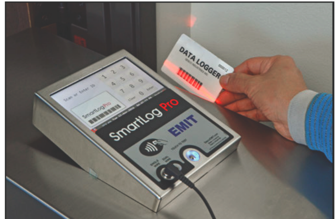
Figure 3. Using the barcode scanner

NOTE: Hold the proximity badge in front of the RFID icon for a full second if using proximity badges. See Figure 4.