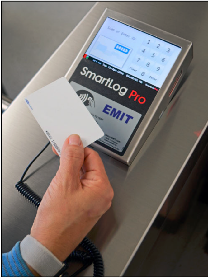
Figure 4. Holding a proximity badge in front of the RFID icon on the SmartLog Pro™