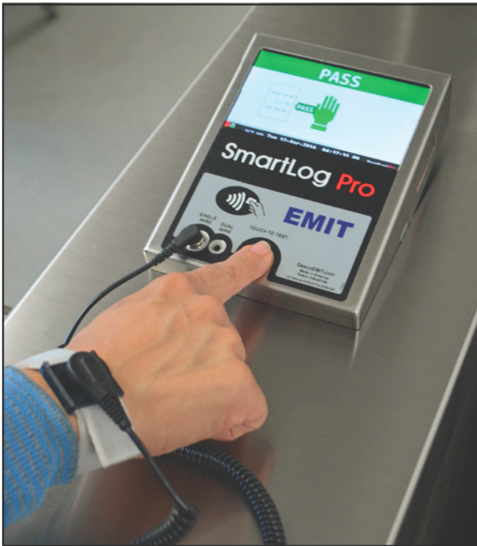
Figure 6. Performing a single-wire wrist strap test