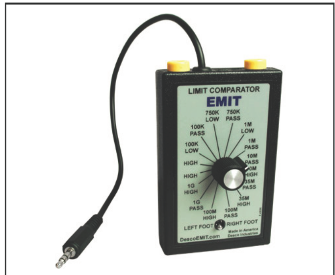
Figure 7. EMIT 50424 Limit Comparator