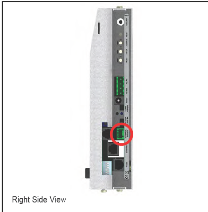
Figure 2. Locating the External Reader port on the SmartLog V5™