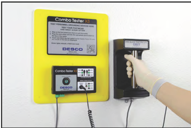
Figure 5. Using the ESD Glove Test Fixture with the Combo Tester X3

http://emit.descoindustries.com/Warranty.aspx