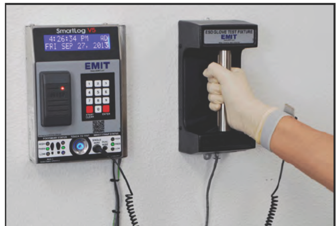
Figure 4. Using the ESD Glove Test Fixture with the SmartLog V5™