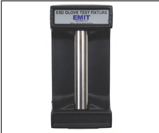
Figure 1. EMIT 50755 ESD Glove Test Fixture