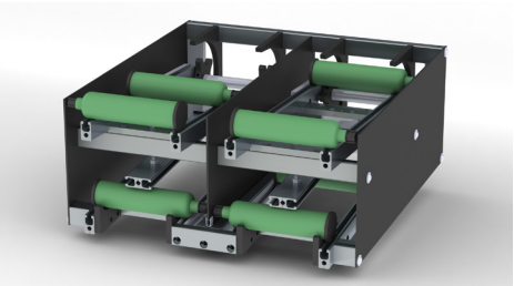
Small cartridge module