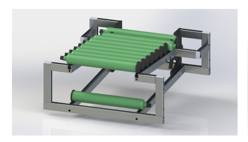
Big cartridge module