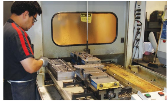
Tronex CNC machine produces high tolerance parts.