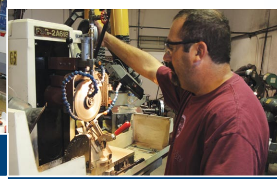
Surface grinding at Tronex insures exceptionally sharp cutting edges.