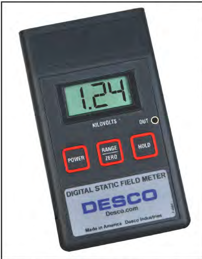
Figure 1. Desco 19492 Digital Static Field Meter