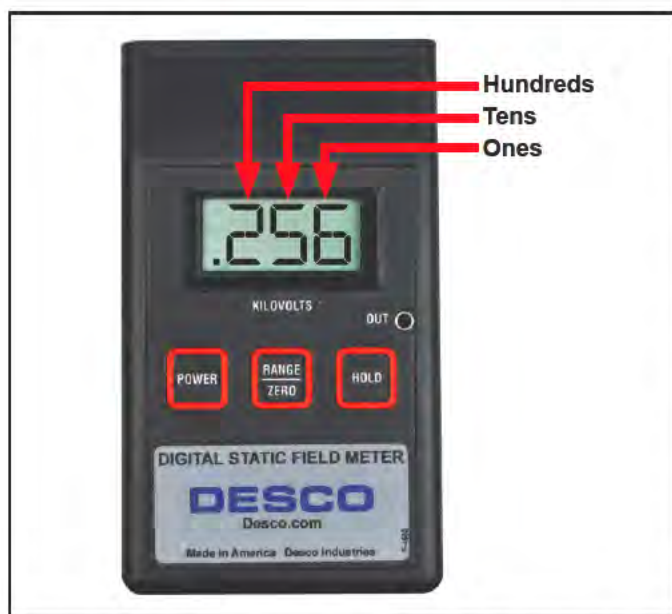
Figure 4. Reading the Digital Static Field Meter while in the \pm 2\text{kV} range

Note: This aspect ratio should be at least 3 for best accuracy, i.e. the object should be at least a 3 inch (75mm) square when measuring at a 1 inch (25mm) distance. Accurate measurements may be made at other measurement distances by scaling the meter range and observing the proper aspect ratio. For example, at a measurement distance of 3 inch (75mm), multiply the meter reading by 3 to give a range of 0 to 60 kilovolts. For accuracy, the object being measured at this distance should be at least a 9 inch (230mm) square.