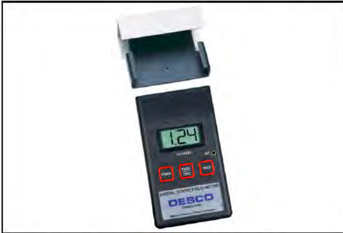
Figure 5. Installing the 19441 Conductive Plate