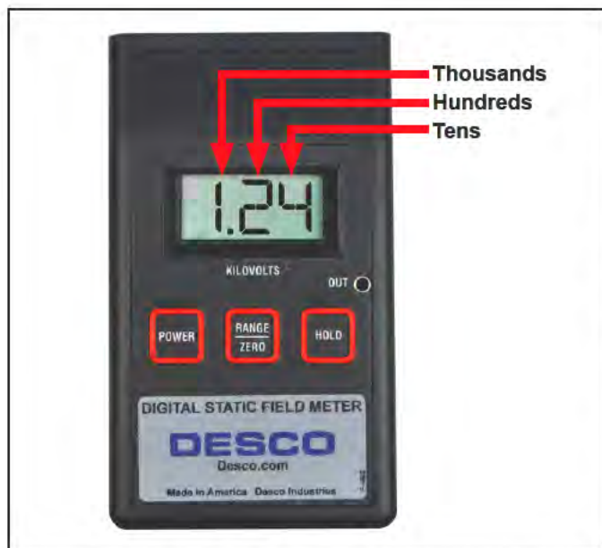
Figure 3. Reading the Digital Static Field Meter while in the \pm 20\text{kV} range